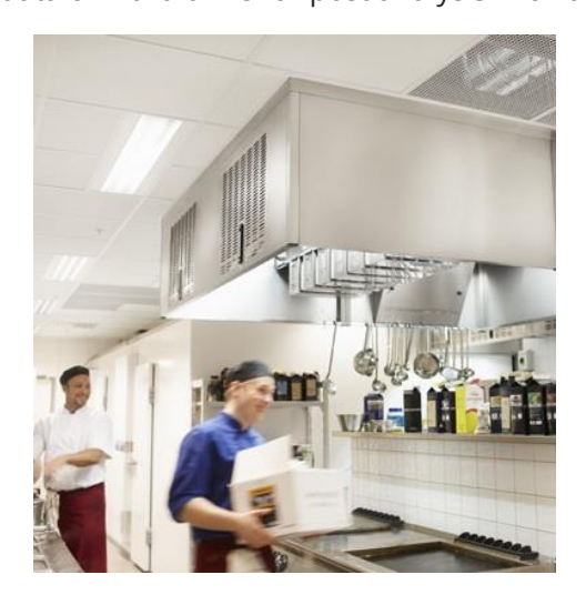
Figure 1. Acticon kitchen ventilation

The Acticon air and acoustic technology laboratory is used when developing and evaluating standard products as well as customer-specific solutions. To increase the efficiency and the capabilities of the laboratory, Acticon needed to add a measurement and data acquisition system that could log multiple channels of air pressure, air speed and air flow as well as temperature and sound. All sampled data must be synchronized and displayed in real time. It shall also be possible to store the measured data on hard drive for post analysis in a variety of tools.