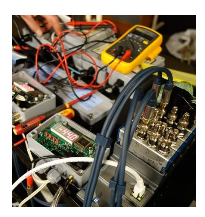
Figure 2. NI 9148 RIO Chassis

A standard Ethernet cable is used to connect the chassis to the measurement PC. Furthermore, the PC also receives electrical measurements from a custom made data acquisition unit, and sound measurements from an acoustic real time analyzer device connected through a USB port.