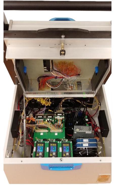
Figure 3: Instrumentation in the fixture-box

To connect all the USB-instruments inside the box.