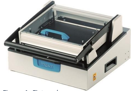
Figure 1: Fixture box

The Ingun fixture is modular and separates the test instrumentation located in the box (or "I/O-box") at the bottom, from the DUT mounted in the so-called