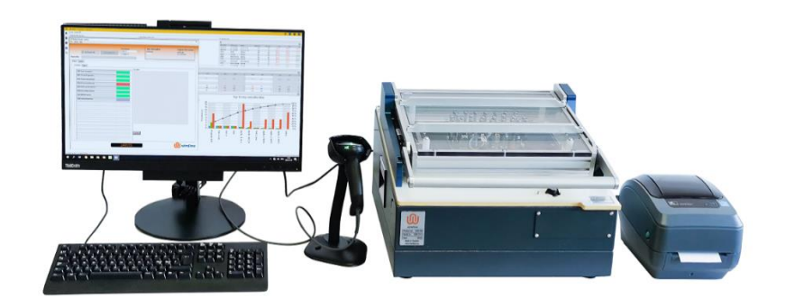
Figure 4 Test station with computer, barcode scanner, fixture and label printer

To streamline the work at the test station, it is usually a good idea to add a barcode scanner to identify the board to be tested. This information can be used by the test system to select the correct test sequence, software package for programming etc. The WireFlow test framework integrates well with most scanners on the market. We have had good experience using the Zebra scanners, for example the <a href="DS2200">DS2200</a> series scanners.