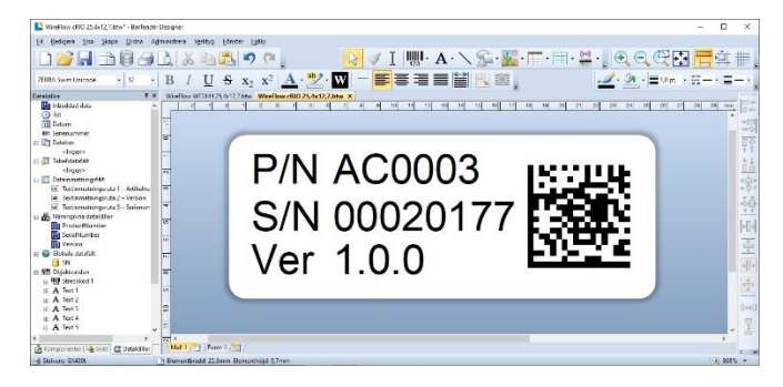
Figure 3 BarTender, the barcode labeling software

For designing labels, we use the <u>BarTender</u> barcode labeling software from Seagull Scientific. It is the leading software tool for creating labels and barcodes. WireFlow has the skill and experience to design your labels for you. The tool integrates well with both the WireFlow test framework and the manufacturing planning database, and receives data for product id, serial numbers etc. from those systems.